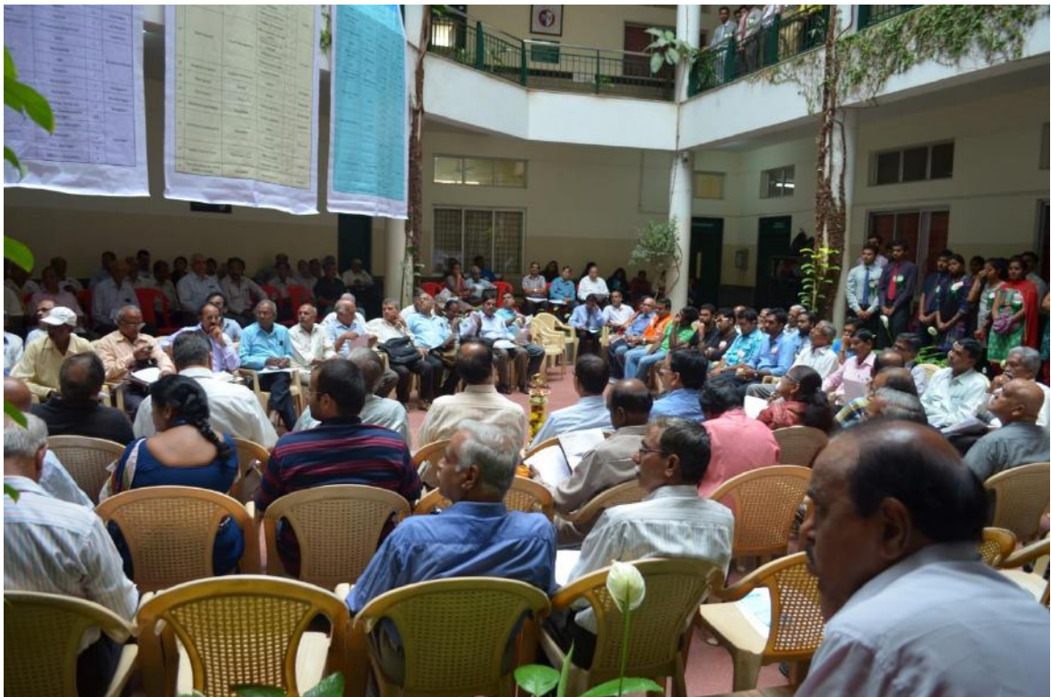
Job fair organized by RVIM in campus in association with Nightingale Empowerment Foundation