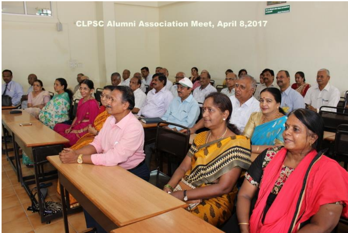
For the First Time Senior Citizens Computer Trainees Alumni was initiated on April 8, 2017