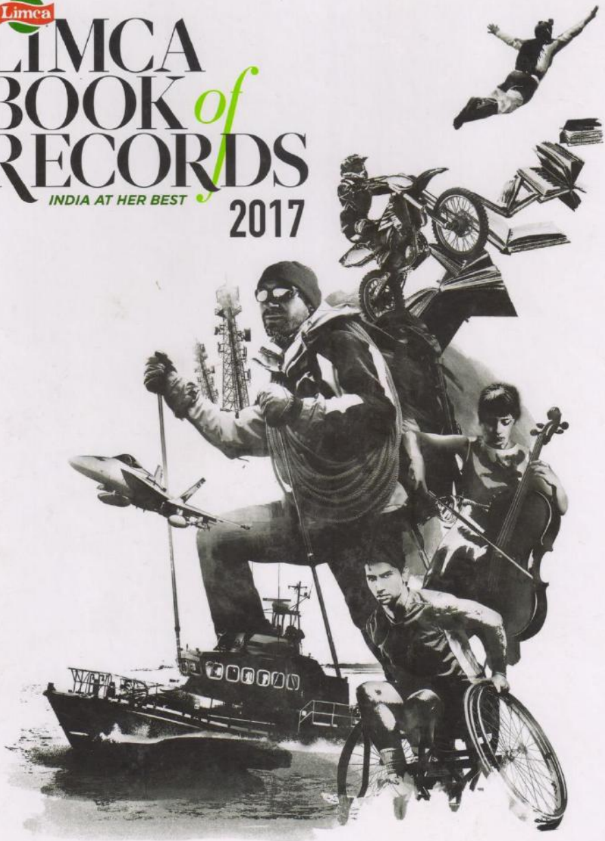
LIMCA BOOK OF RECORDS 2017-COVER PAGE