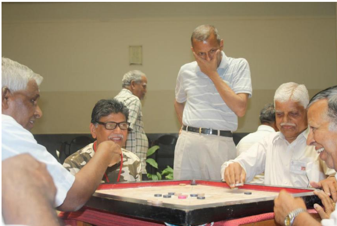
Senior Citizen Sports