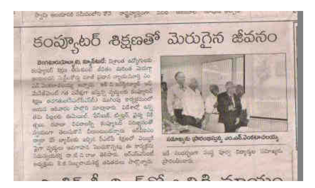
E Nadu (Karnataka May 23, 2016 – Pg 4 Telugu