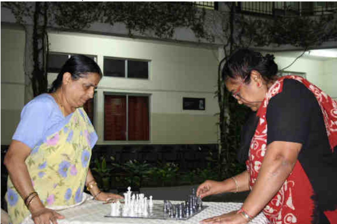
Sports for the Senior Citizens-Chess