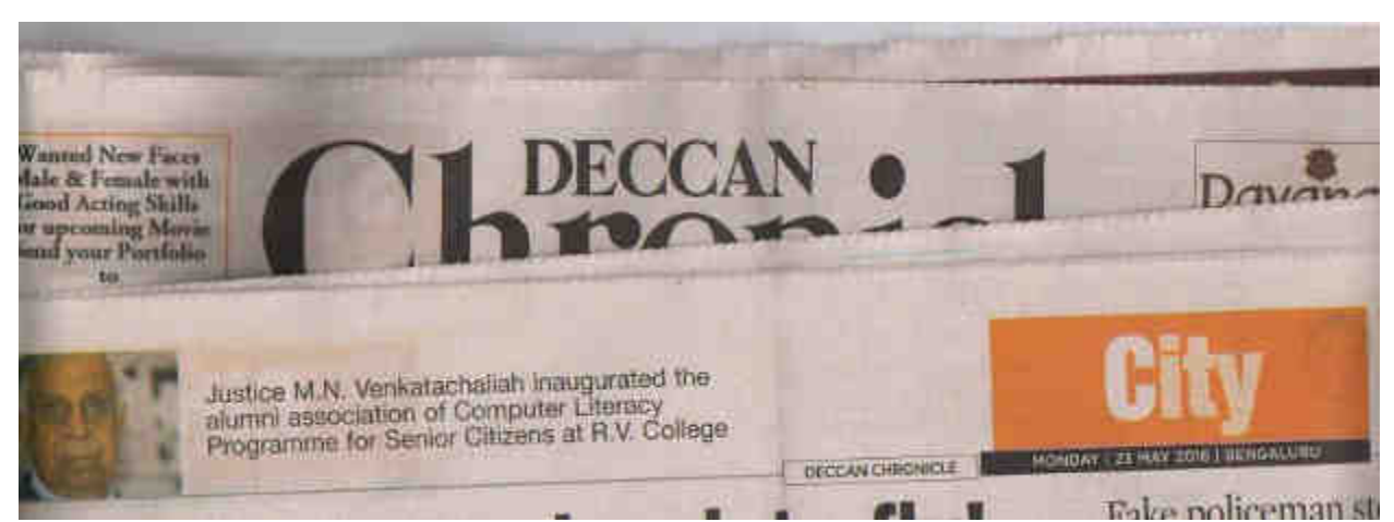
Deccan Chronicle –Bangalore May 23, 2016 Pg 3