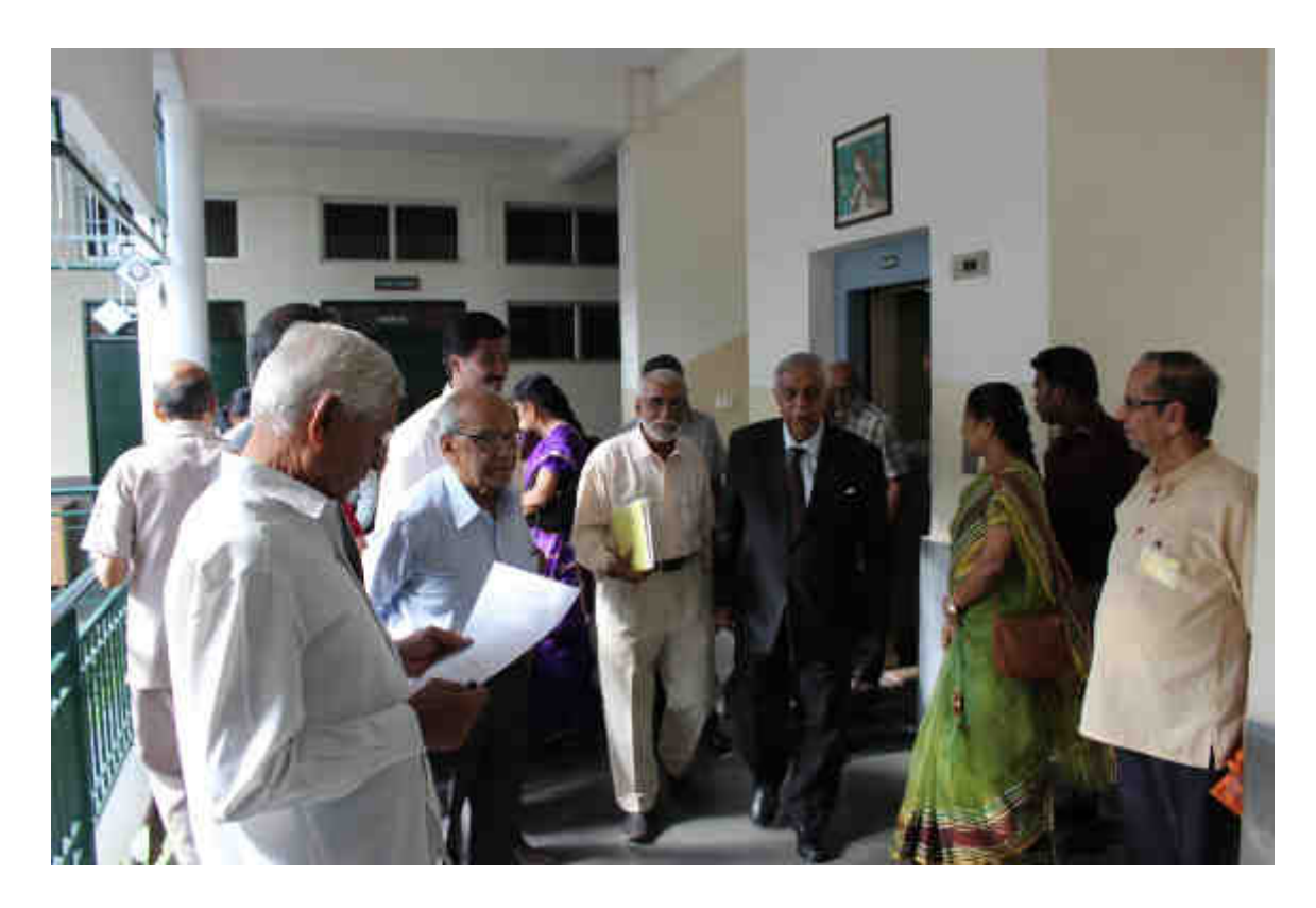
Hon'ble Justice arrives to Campus Seminar Hall

Hon'ble Justice is greeted by the senior participants of CLPSC. Director, RVIM welcomed the guest to the campus.