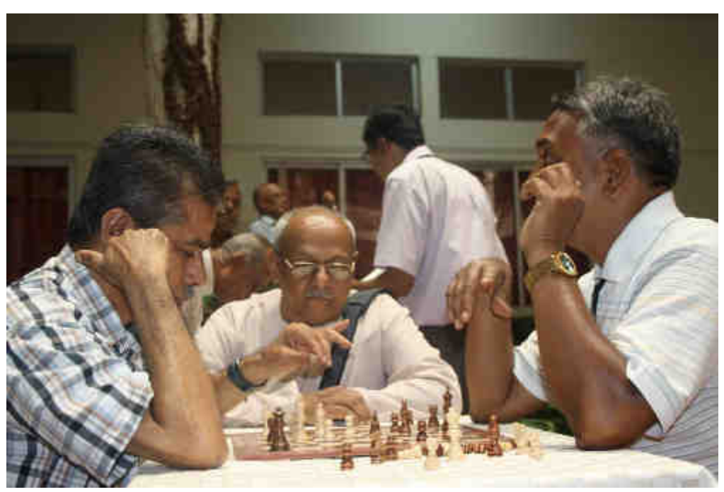
Sports for the Senior Citizens- Chess