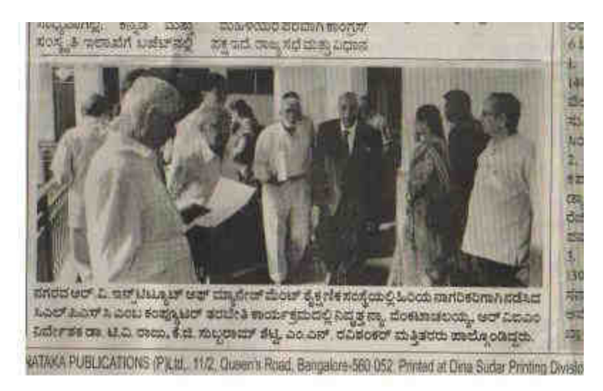
Sanjevani May 23, 2016 Pg.2 Kannada