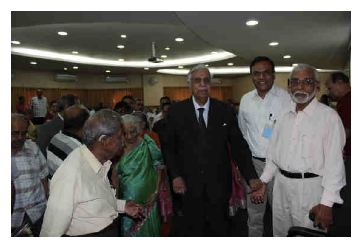
Chief Guest leaves Seminar Hall after the Programme