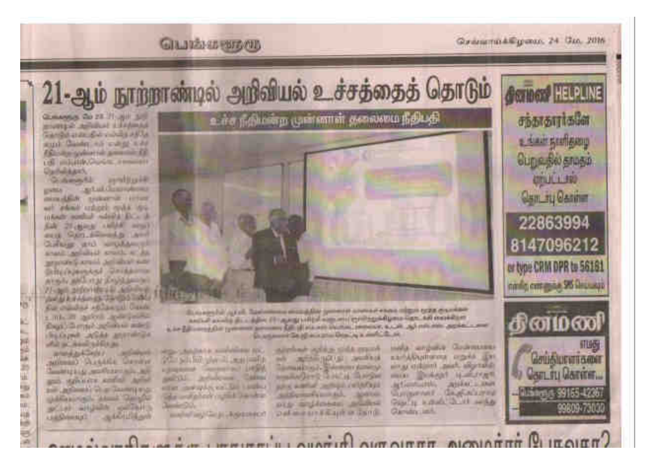
Dinamani – Bangalore May 24, 2016 Pg. 2 Tamil