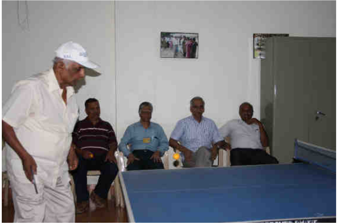
Sports for the Senior Citizens-Table Tennis