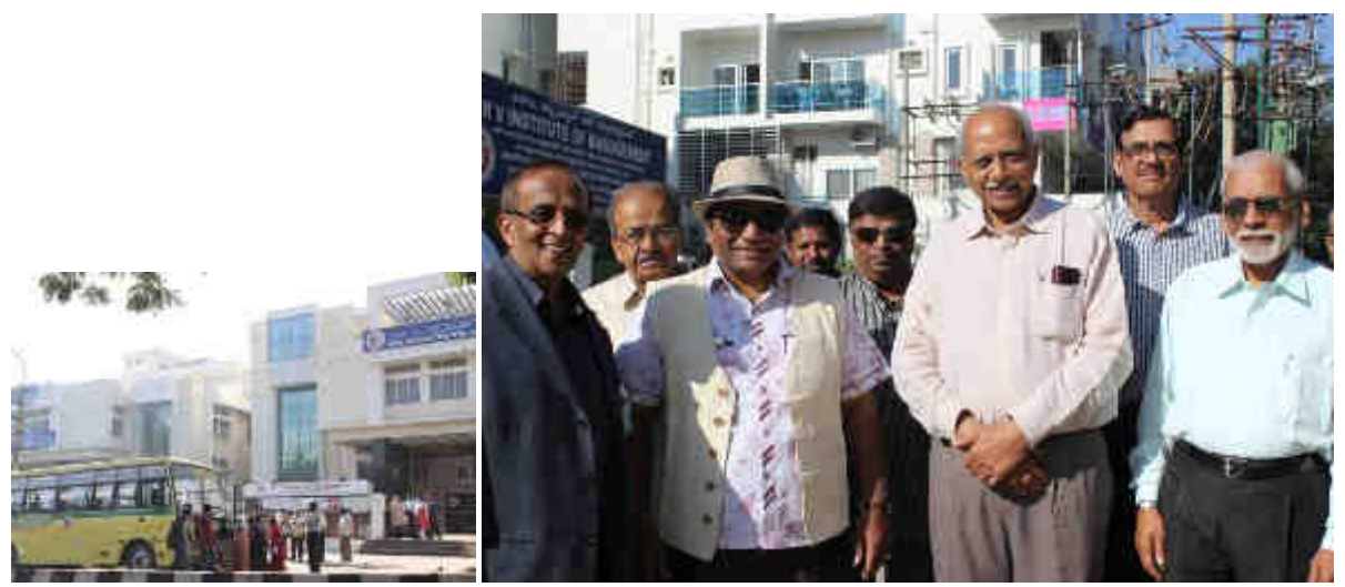
One day excursion for senior citizen participants of CLPSC . Director RVIM (Third from right)