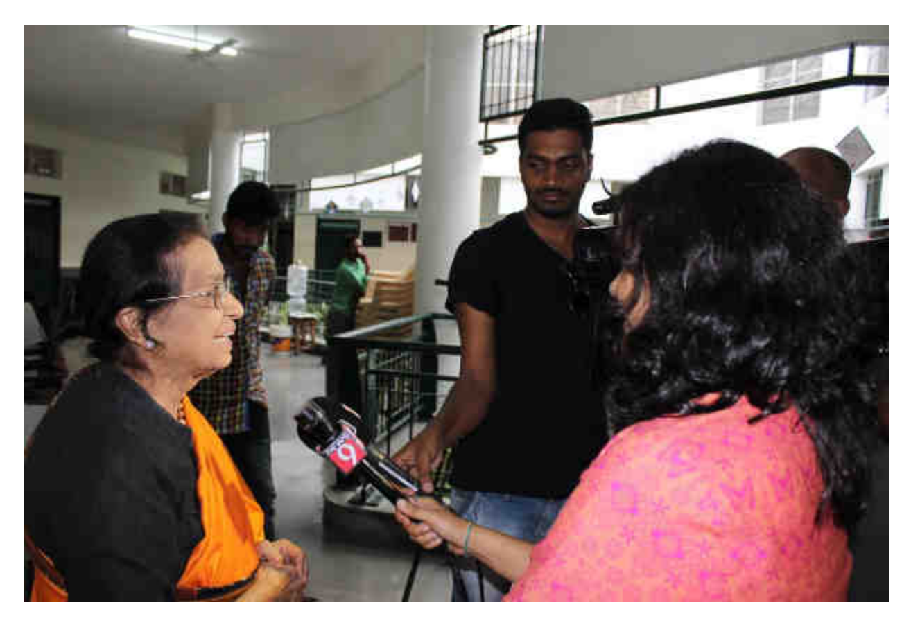
Senior most participant of CLPSC speaks to TV Channel at Seminar Hall