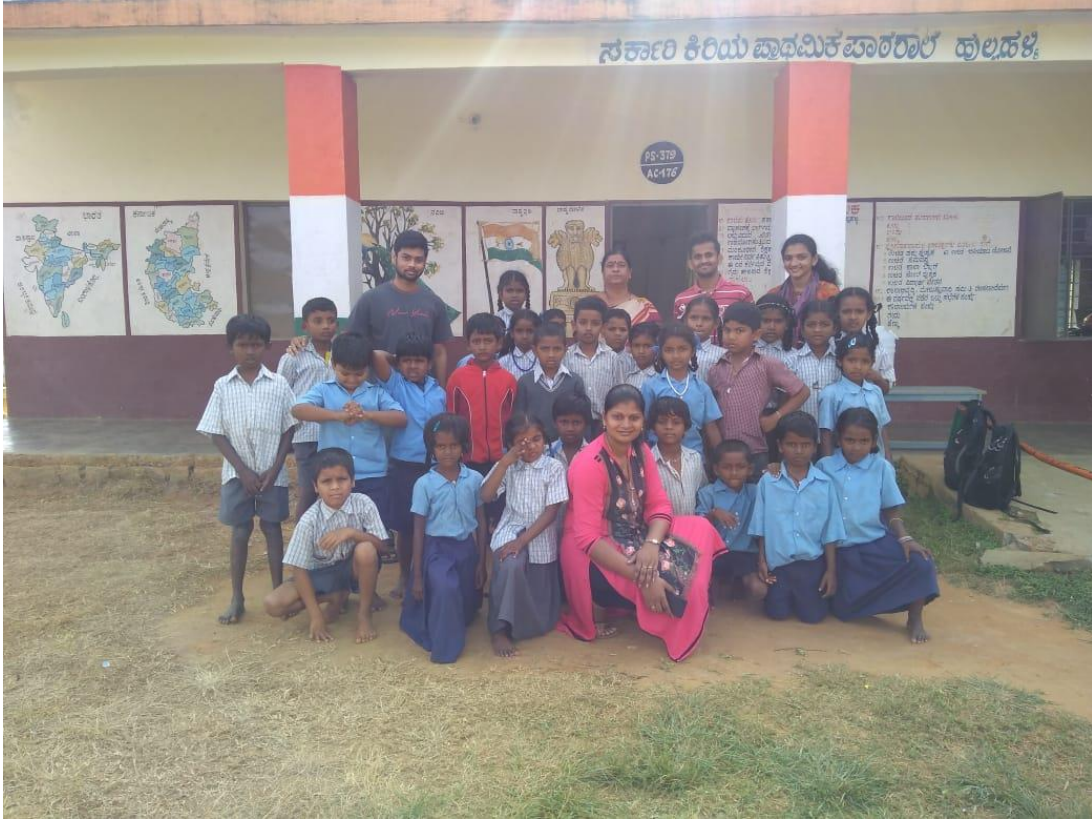
RVIM Student Team with Teachers and Students At Government Primary School,Hullahalli