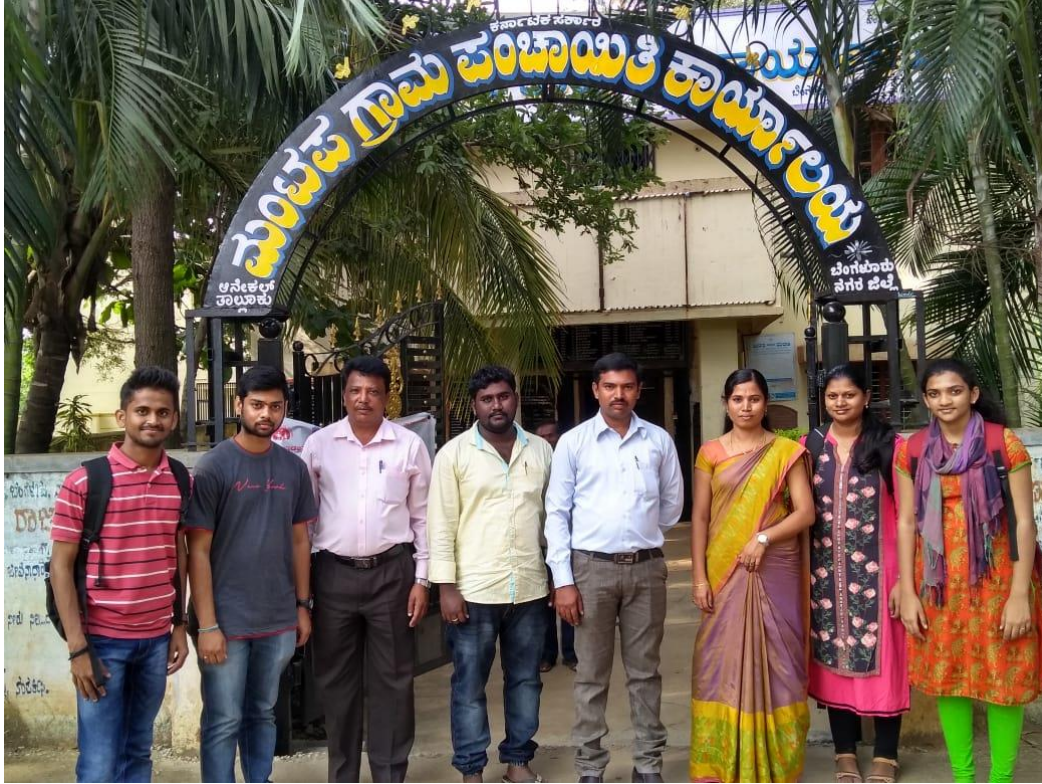
Students at Mantapa Grama Panchayat Office with administrators