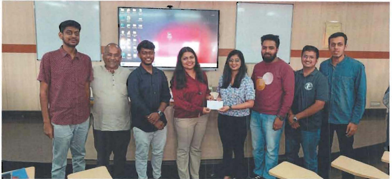
Second Prize Winners