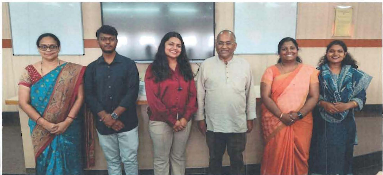
Valedictory Program and Group Photo