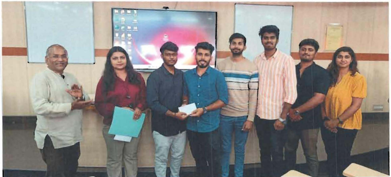
Third Prize Winners