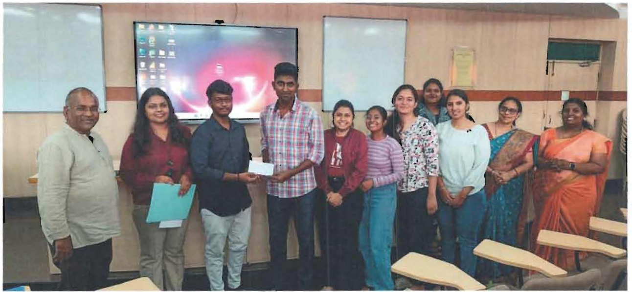
Consolation Prize Winners