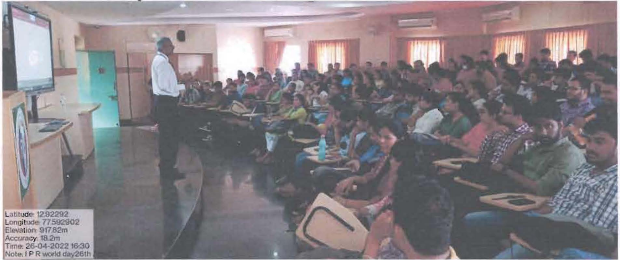
Photo of the Workshop