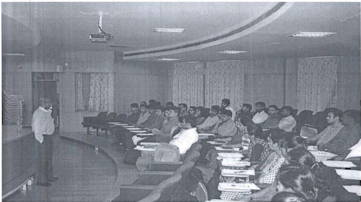
I semester students participating in the workshop