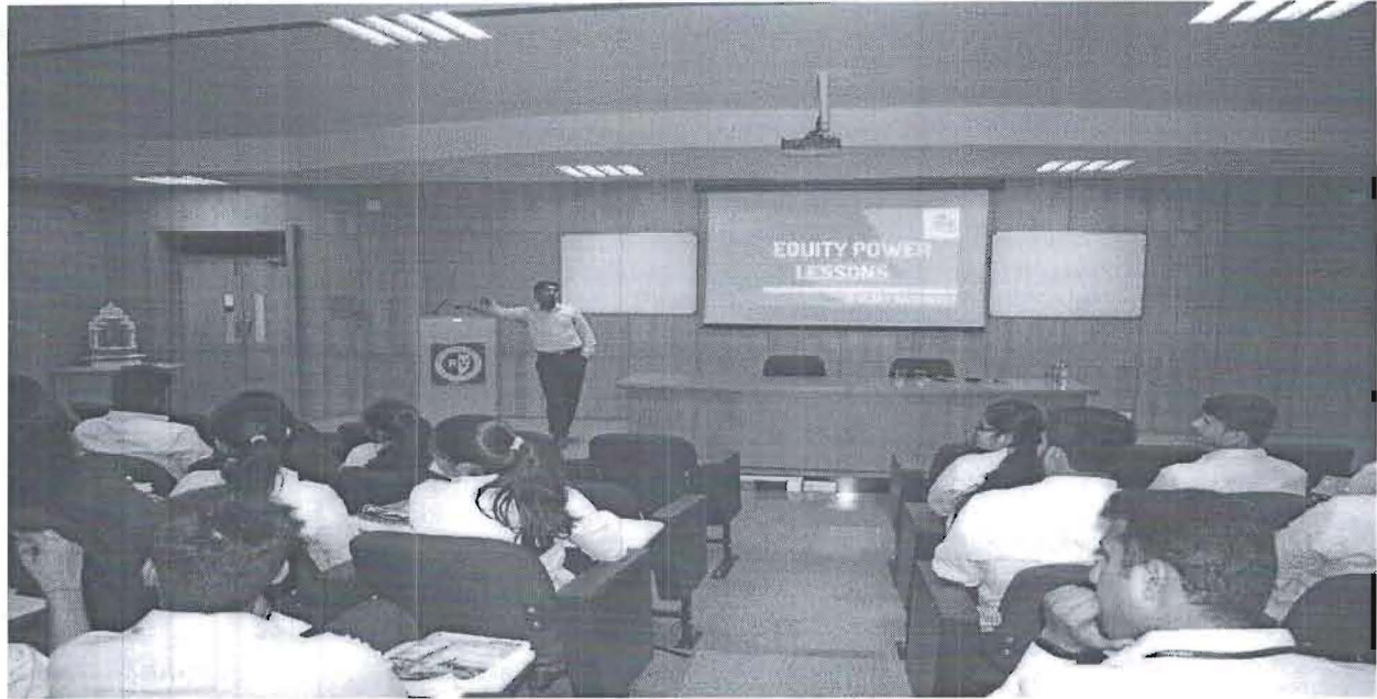
III semester students participating in the workshop