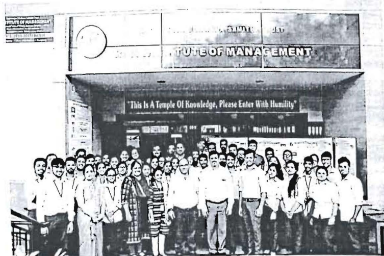
Photo of the supply chain management workshop