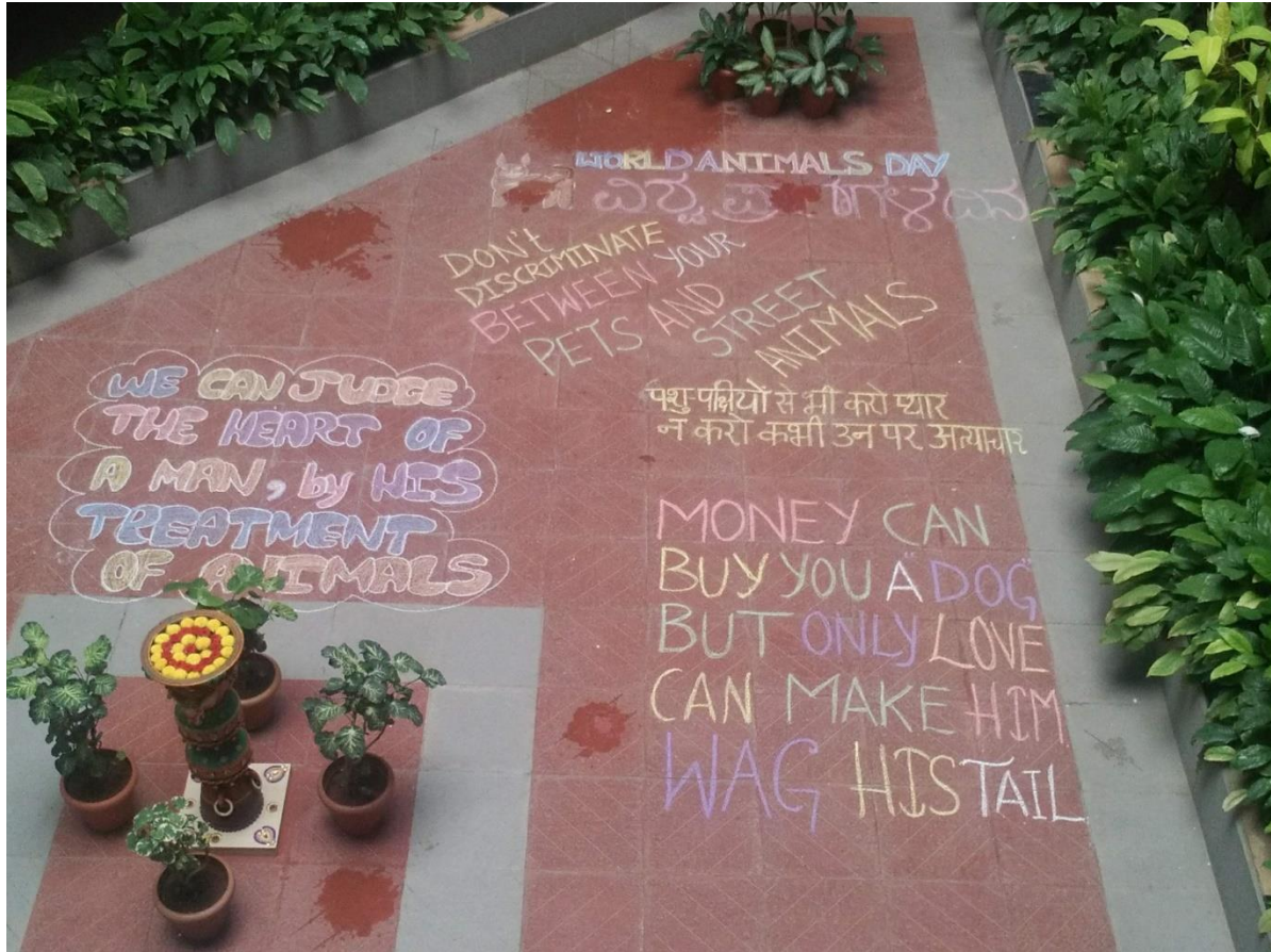
View of the Floor Art Created by Students