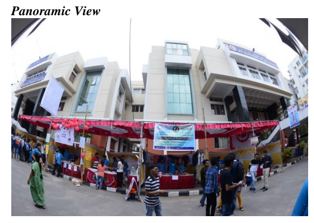
Cooking Behind the Stalls