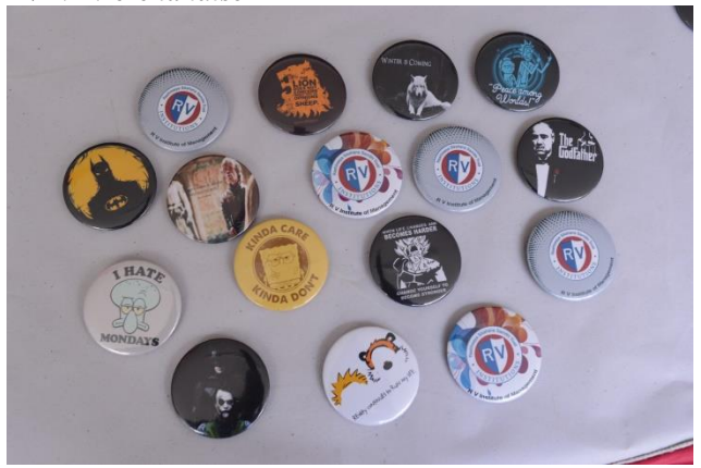
Engaging the Customers