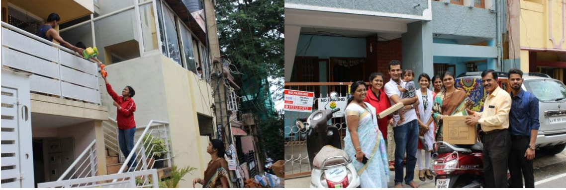
Photo9: Faculty and Student collecting toys and stationeries from residents of Jayanagar