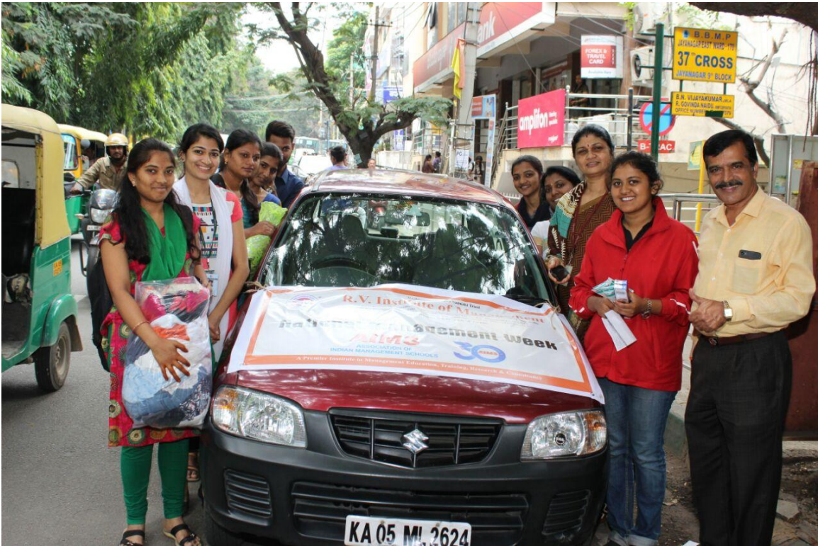
Photo 10:Staff Car used for collection of materials. Team at the end of Collection of materials