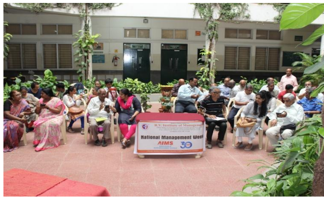
Photo 3: Teaching Senior Citizens on Health Care Apps

Digital Literacy among senior citizens is a challenge due to technology adaptation. Faculty members and students associated to teach senior citizens usage of App. They were taught from basics like switching on, downloading App and using doctor apps for seeking medical advices.