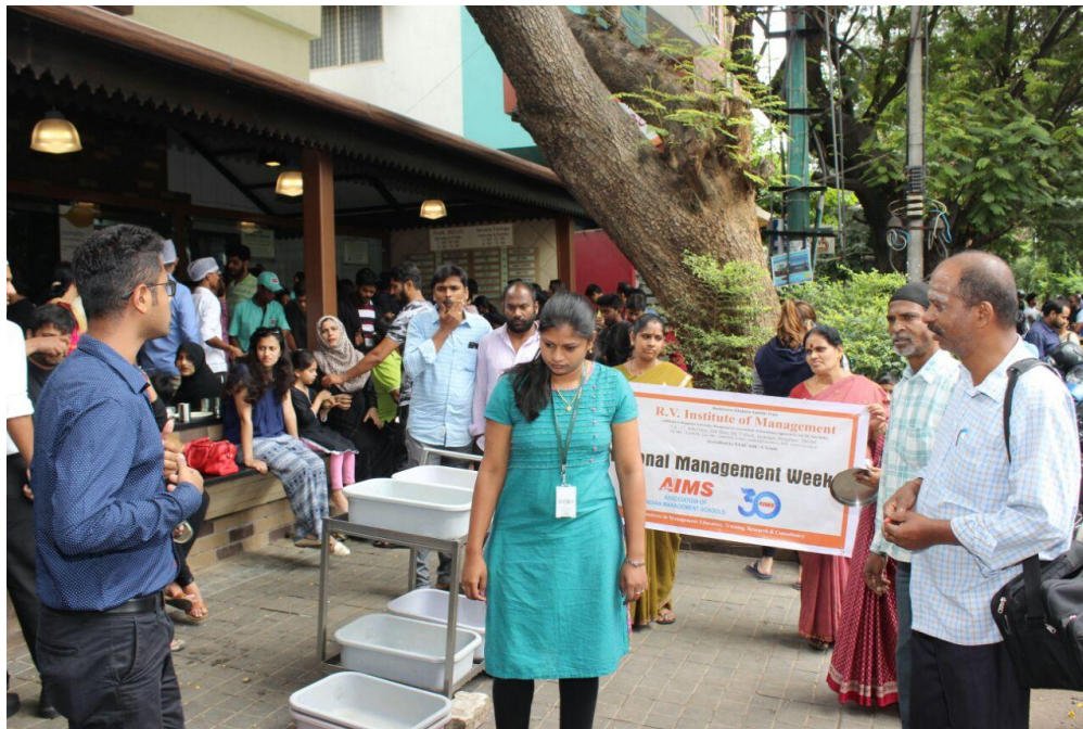
Photo 8: Street Play to create awareness about recycling and inform the residents regarding door to door collection of materials and Collection center in Campus