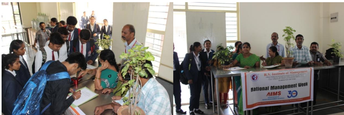
Photo 5: Awareness programme to promote Vertical and Terrace Gardens at Home

The concept of Vertical garden, Terrace garden is spreading in urban environment due to lack space. Awareness is lacking. Helper Staff with college Gardner and Faculty members organized an awareness programme to develop garden in every homes. Students were approached in the college canteen during lunch time. A total of 445 students in the campus took a pledge to grow plants in their homes.