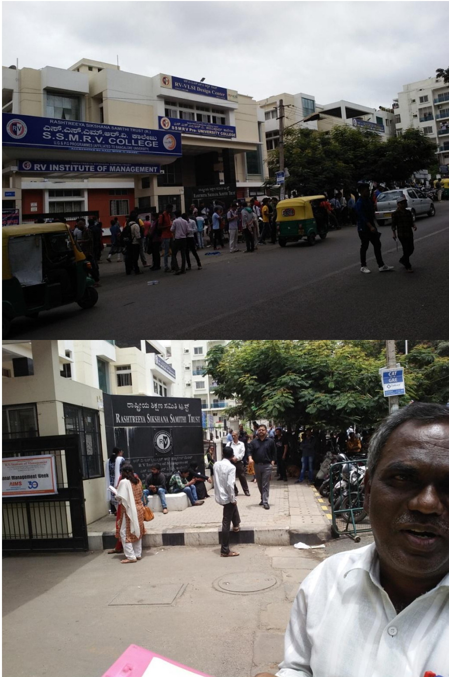
Photo 13: Generation of ideas for MOOCs Training Programme through Focused Group Interviews

Parents waiting outside an examination centre were approached to gather ideas for waste segregation. This information is used to develop MOOCs and Online Programmes for educationalists, managers and tiny business proprietors.