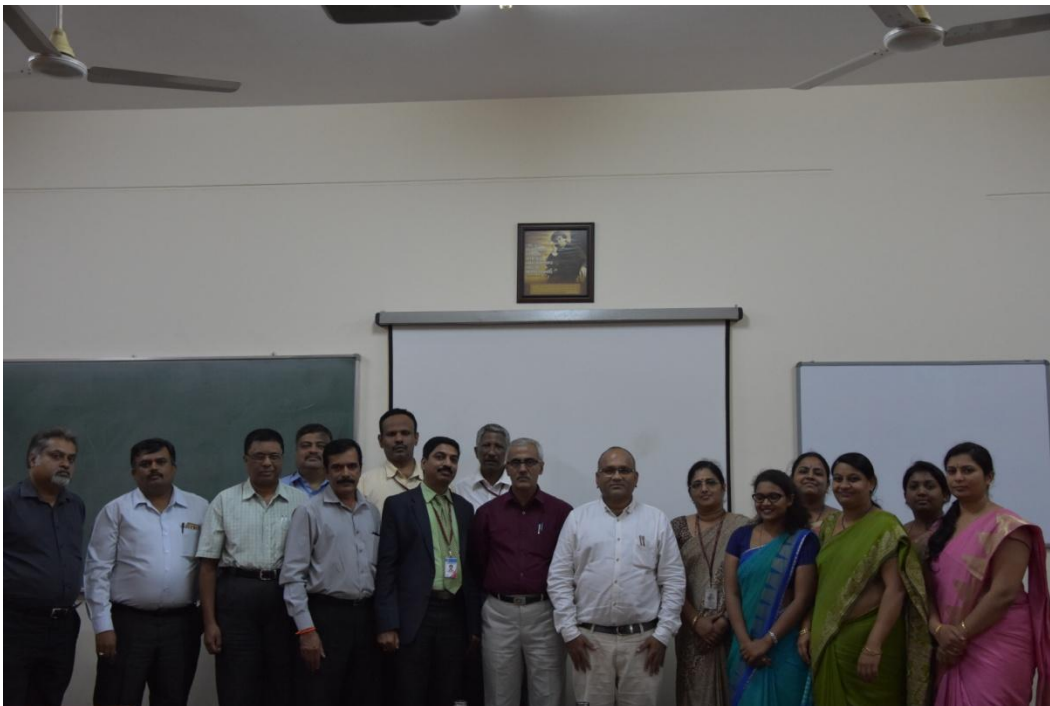
Photo 21: Director RVIM and Principal RVCE with faculty members on the last day of National Management Week 2018