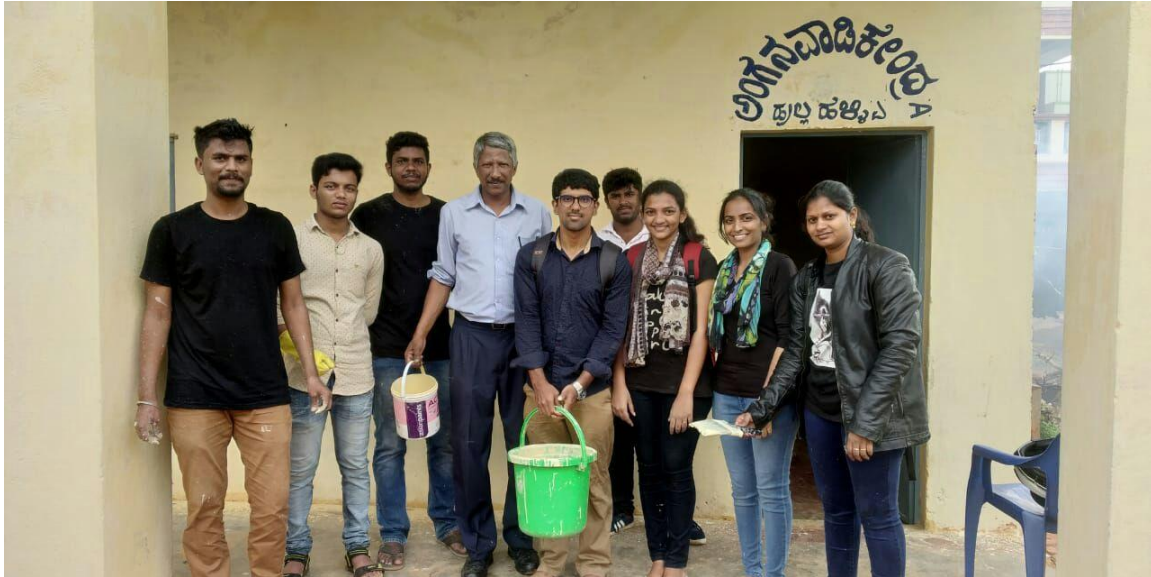
Photo 2: Painting of Anganwadi School Wall in Hullahalli Village-Team with Coordinator

Students engaged in activities in village -Hullahalli ,Anekal Taluk. The village is 20 kms from the college campus. Cleaning the surrounding and painting of school building was taken up as a part of service to community and Swachh Bharat initiatives.